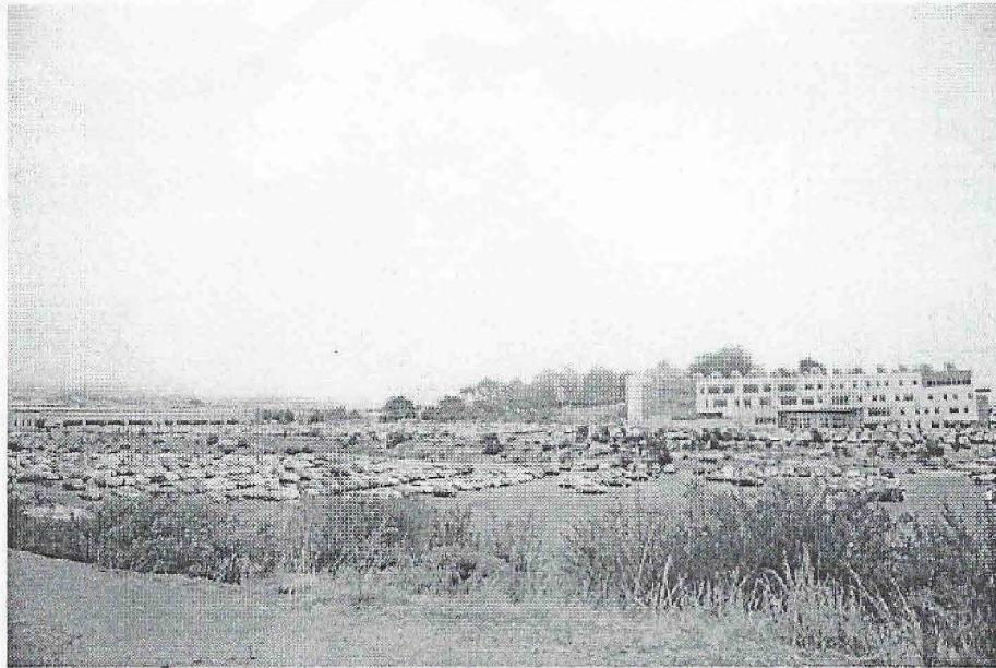
View of far end of Balboa Reservoir parking area at 9:30- out of frame portion is full. Taken Aug 28 2017 by Otto Pippenger.

For more information, visit the Balboa Reservoir Community Advisory Committee website. ( http://sf-planning.org/balboa-reservoir-cac-meeting-schedule )