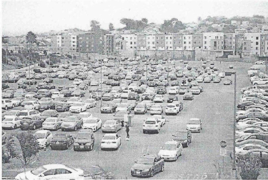
Balboa Reservoir parking at 12:30 as classes get out. Taken Aug 28 2017 by Otto Pippenger.

September 13, 2017 The Guardsman By Bethaney Lee